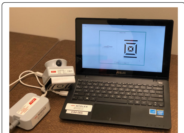
Fig. 2 Electrical Impedance Myography Legend: The EIM device consists of a laptop computer connected to a portable handheld sensor

We will obtain forced vital capacity and forced expiratory volume in 1 s, both standardized outcomes used commonly in the clinic and in clinical trials.