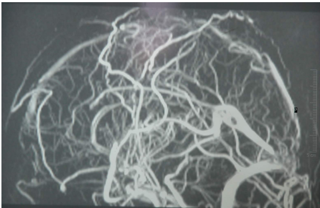
Figure 3 2D MR venogram shows sagittal sinus thrombosis.