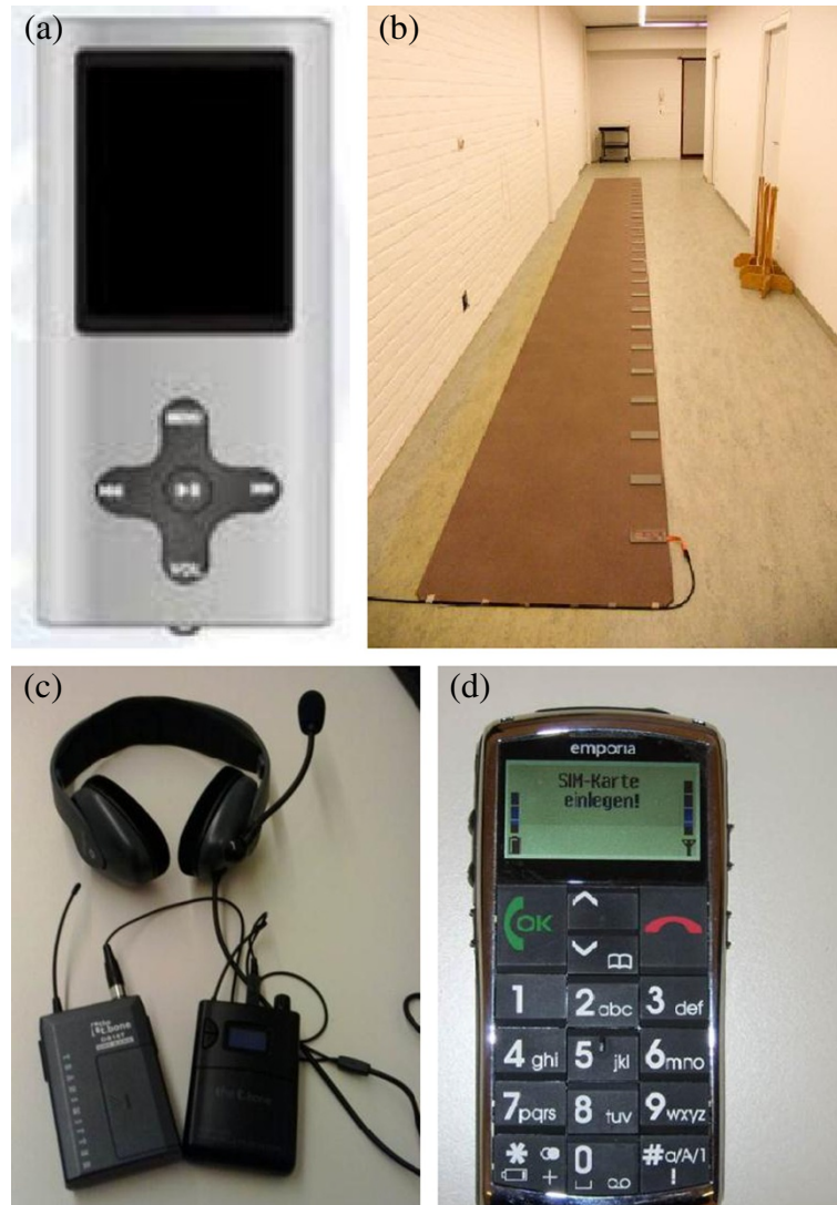
Figure 2 Equipment used during training and testing. (a) MP3-player (DIFRNC MP1850); (b) GaitRite Electronic Walkway System; (c) wireless headset system (Beyerdynamic; transmitter: t-bone DS16T and receiver: t-bone IEM100R); (d) large buttoned mobile phone (EmporiaTalkPremium).

will be adopted as guidelines to progress to the next level. Functional tasks, relevant for each patient, are chosen for the functional part of the training program to ensure generalization of practice (Table 2).